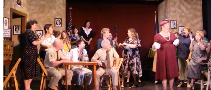
The Brandon Town Players performing Kilroy Was Here .

Due to neglect and disrepair, the town closed the hall in 1981, but in 1998 The Friends of The Brandon Town Hall was established as a volunteer corps of concerned citizens to rebuild, restore, and renovate Town Hall. It is now a vibrant and exciting center of town activities.