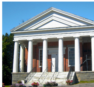
Brandon Town Hall

The grand and historic Brandon Town Hall was built in 1861 and its first use was the gathering place for Union soldiers leaving to fight in the Civil War. It subsequently became a destination point for Brandon and surrounding communities. As one of the largest buildings in town and situated in the center of Brandon, it is more than a landmark; it is an important community resource intimately tied to Brandon's history and its future.