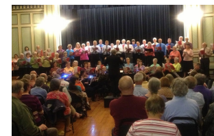
Brandon Town Hall