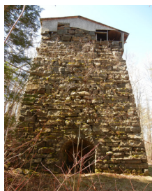
Forest Dale blast furnace.

This hour-long meander connects the two villages of the Town of Brandon and heads out past the golf course to working agricultural land and the village of Forest Dale. The 1856 smokestack visible from Newton Road and the Forest Dale blast furnace later on are enduring reminders of the early industry pursued in this part of town.