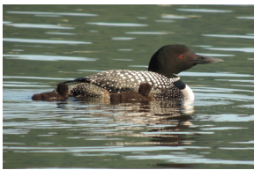
A mother loon swims with her chicks on Lake Dunmore

Birds: Thrushes, grosbeaks, warblers, and loons during breeding season.